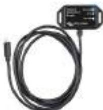
VE.Direct Bluetooth Smart dongle (must be ordered separately)

An excessively high or low battery voltage is indicated by an audible and visual alarm, and a relay for remote signalling.