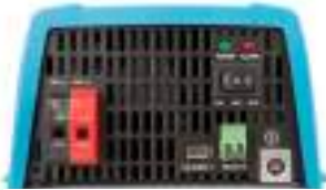
Phoenix 12/375 VE.Direct